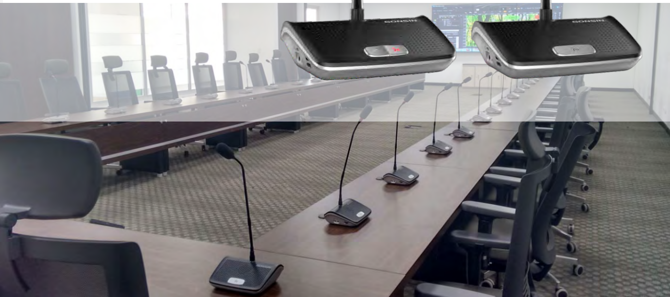
TL-VD3300 delegate unit